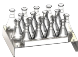
Shelf reversible for 2 heights